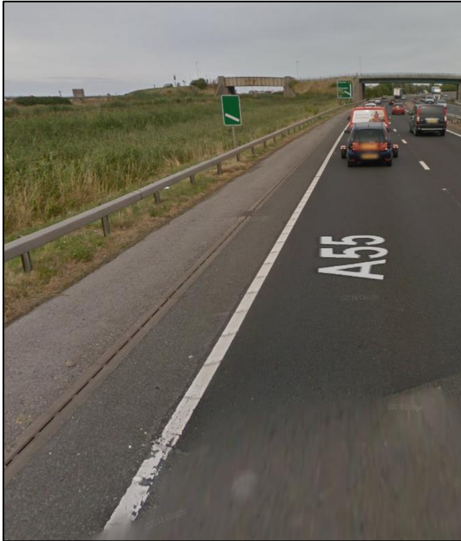
Photograph of possible location for Rhyl A55 brown sign on eastbound carriageway in advance of Junction 23a (Pensarn)