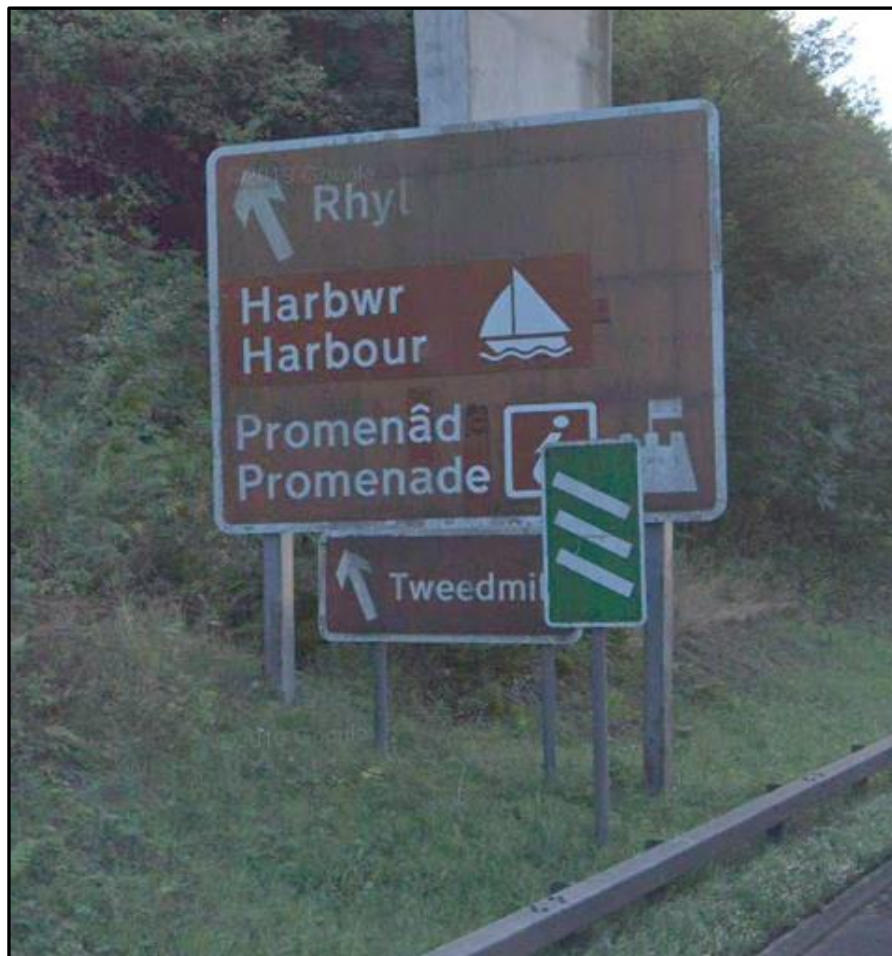
Photograph of existing Rhyl A55 brown sign on westbound carriageway in advance of Junction 27 (Talardy)